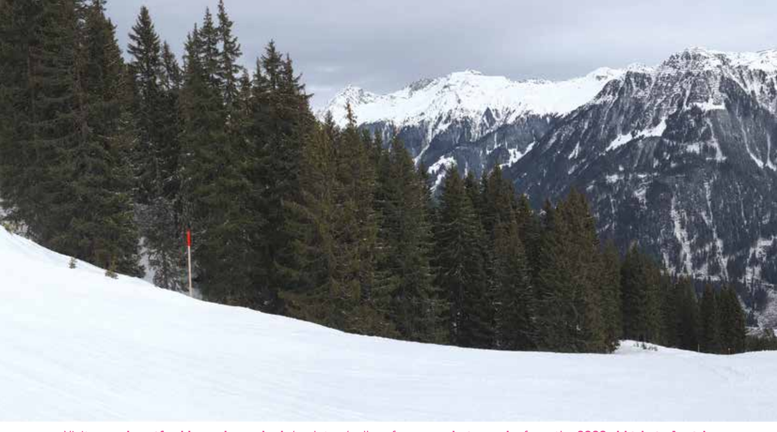
Visit www.brentford.hounslow.sch.uk/updates/gallery for more photographs from the 2020 ski trip to Austria